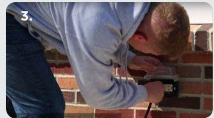
3. Plug into power source.