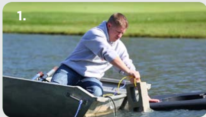
1. Anchor the float.*