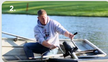
2. Insert motor assembly into the float.